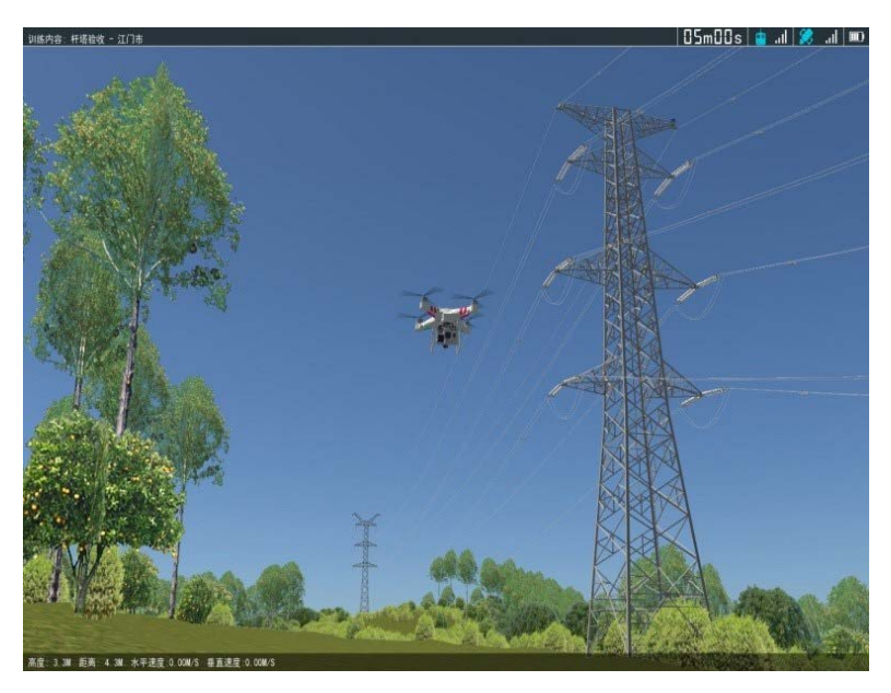
Fig. 3. Visual scene simulation

the system based on this method make the simulation of electric transmission line inspection using UAV more real and could support the feedback of operation process and inspection results. What's more, the control experience is more authentic.